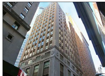
63 Wall Street

City: New York Buyer: Rockpoint Group Purchase Price: $239 MM Price per Unit: $502,341