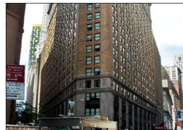
67 Wall Street

City: New York Buyer: Rockpoint Group Purchase Price: $182 MM Price per Unit: $551,032