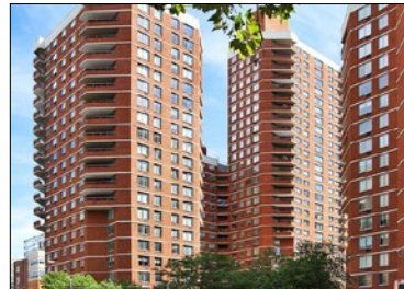
Kips Bay Court

City: New York Buyer: Blackstone Group Purchase Price: $620 MM Price per Unit: $695,512