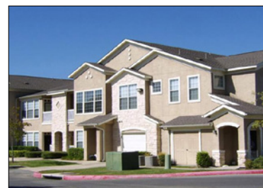
The View at Encino Commons

City: San Antonio Buyer: Draper & Kramer Purchase Price: $46 MM Price per Unit: $140,481