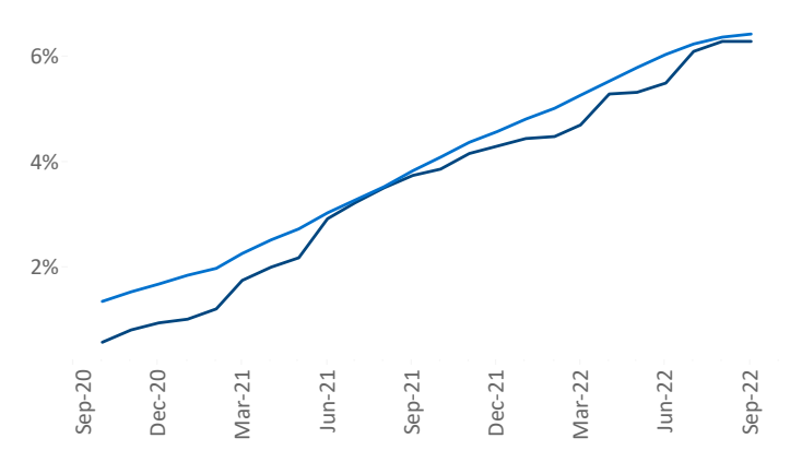
Units Under Construction as % of Stock