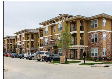
Residences at Prairiefire

City: Overland Park, Kan. Buyer: CRES Management Purchase Price: $62 MM Price per Unit: $206,573