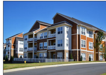
Cascades of Northlake

City: Charlotte, N.C. Buyer: Cortland Partners Purchase Price: $83 MM Price per Unit: $145,000