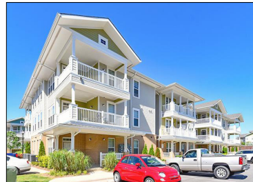
Marquis at Morrison Plantation

City: Mooresville, N.C. Buyer: CWS Capital Partners Purchase Price: $87 MM Price per Unit: $309,609