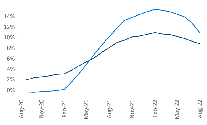
Absorbed Completions T12