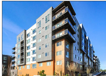
LIV Bel - Red

City: Bellevue, Wash. Buyer: Kennedy Wilson Purchase Price: $172 MM Price per Unit: $380,624