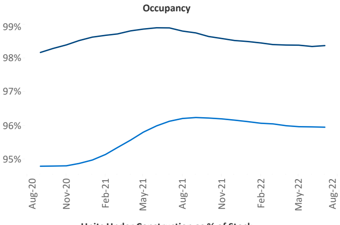
Units Under Construction as % of Stock