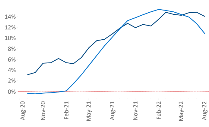
Absorbed Completions T12