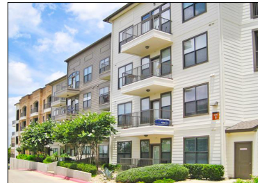
The Davis SoCo

City: Austin, Texas Buyer: Sendera Investment Group Purchase Price: $65 MM Price per Unit: $174,488