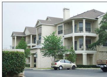
The Preserve at Rolling Oaks

City: Austin, Texas Buyer: Cortland Partners Purchase Price: $64 MM Price per Unit: $129,555