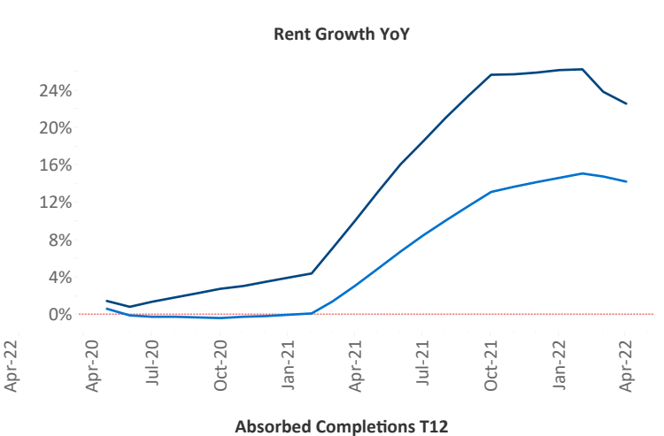
Tampa - St Petersburg National Occupancy 96%

Employment in Tampa - St Petersburg has grown by 5.2% ▲ over the past 12 months, while hourly wages have risen by 2.9% ▲ YoY to $27.50 according to the Bureau of Labor Statistics .