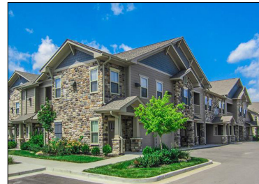
ARIUM Overland Park

City: Overland Park, Kan. Buyer: Carroll Organization Purchase Price: $69 MM Price per Unit: $17,064