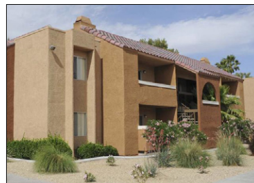
Villas at Green Valley

City: Henderson, Nev. Buyer: Investcorp Purchase Price: $71 MM Price per Unit: $116,174