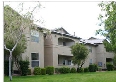
Sky Pointe Landing

City: Las Vegas Buyer: Shopoff Realty Investments Purchase Price: $73 MM Price per Unit: $116,346