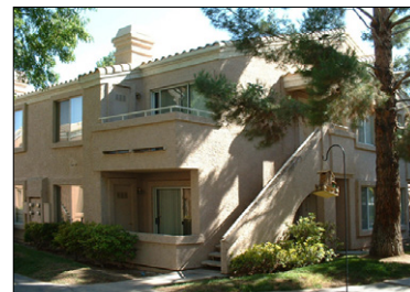
Capri North and South

City: Las Vegas Buyer: Bascom Group Purchase Price: $69 MM Price per Unit: $110,577