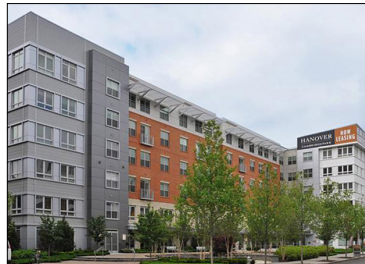
Windsor at Cambridge Park

City: Cambridge, Mass. Buyer: GID Purchase Price: $215 MM Price per Unit: $540,201