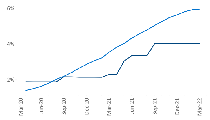
Units Under Construction as % of Stock