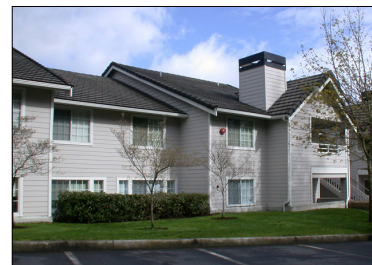
Overlook at The Lakemont

City: Bellevue, Wash. Buyer: Security Properties Purchase Price: $122 MM Price per Unit: $305,000