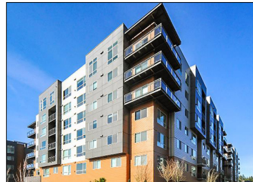
LIV Bel - Red

City: Bellevue, Wash. Buyer: Kennedy Wilson Purchase Price: $172 MM Price per Unit: $380,624