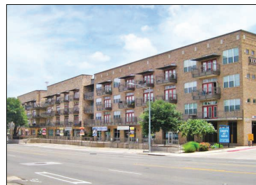
The Davis SoCo

City: Austin Buyer: Sendera Investment Group Purchase Price: $65 MM Price per Unit: $174,488