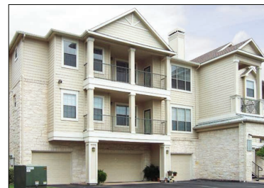
The Preserve at Rolling Oaks

City: Austin Buyer: Cortland Partners Purchase Price: $64 MM Price per Unit: $129,555