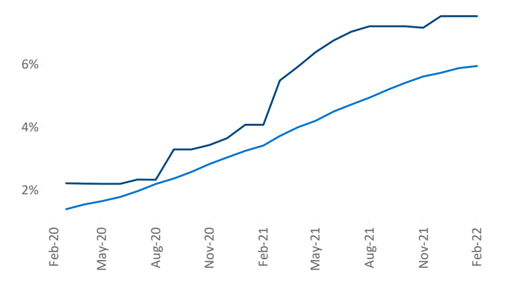
Units Under Construction as % of Stock