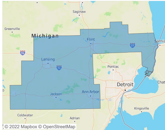
■ Lansing - Ann Arbor ■ National