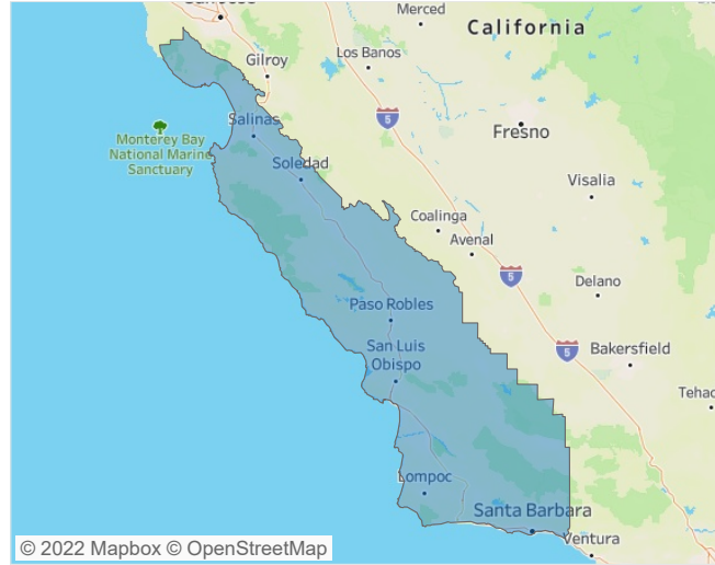
■ Central Coast ■ National