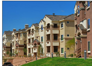
Green Leaf Cottonwood

City: Albuquerque, N.M. Buyer: Green Leaf Partners Purchase Price: $35 MM Price per Unit: $135,974