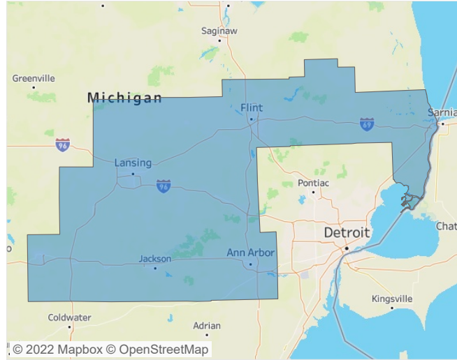
■ Lansing - Ann Arbor ■ National